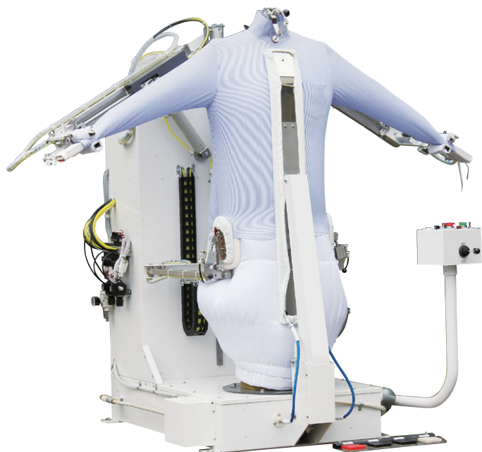
[The state of finishing of a Y-shirt]