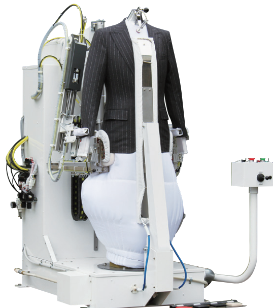
[The state of finishing of a Jacket]